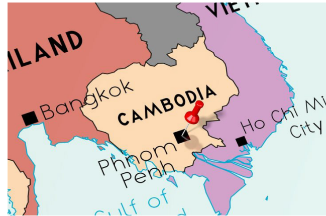
Cambodia is in Southeast Asia. It's on a big piece of land called the Indochinese Peninsula.

The Mekong river, runs from north to south of the country,