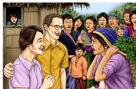
The Lisu studied the Bible during the Rainy Season Bible School months.

★ Draw something that this page talks about. ★