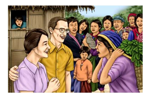
The Lisu studied the Bible during the Rainy Season Bible School months.

Draw something that this page talks about. ★