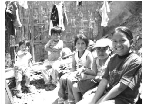
Sunday School kids

Please pray with these Christians that God would show them the right place and provide all that is needed. ■