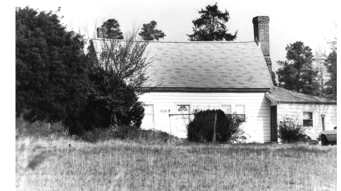
LOTT CARY'S BIRTH-PLACE IN CHARLES CITY COUNTY, VIRGINIA