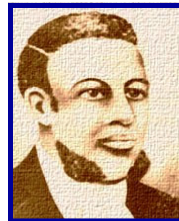
Born 1780, died 1828

Think about ways a missionary can serve Jesus by serving people.