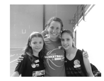
Let's say "Yes!" to God that we will share his love with other people! ■

The week finishes with a fiesta at church. It is packed with campers and parents. During the program that night, one of the basketball team members who knows Jesus shares about what Jesus means to him or her. We pray that God will work in the hearts of the campers and parents so that they too might come to know Jesus and know the great hope and joy we have in Him!