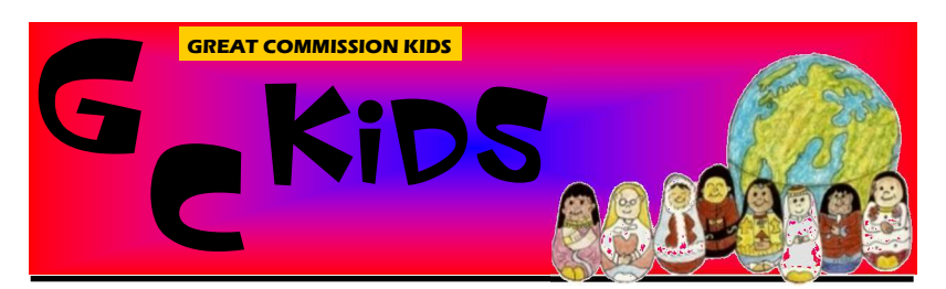
Issue 37: AMAZONIA