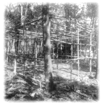
Site of the new church

(Even though this is not about a real boy named Jaku, everything in this story is true. Parts were written by someone who has been there and is going back to stay and tell the indigenous people about Jesus.)