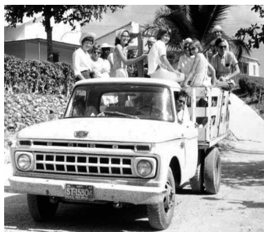
Some of us "MKs" on an outing.

When I was about seven, my mom was going to do a Vacation Bible School in a village called Marie which was about six miles off the