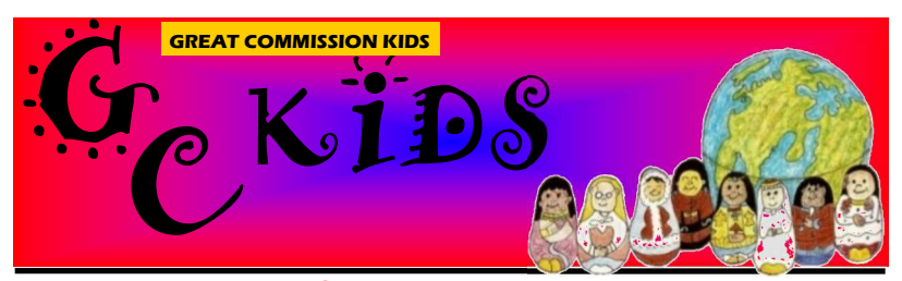
Issue 46: Cameroon, Africa