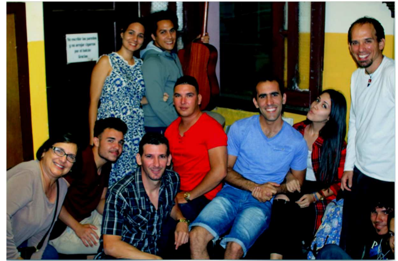
The Coffee House Team

It is a good place to spread news about Jesus. Santa Clara has a big influence on the country. Years ago communism took control of Cuba in Santa Clara, and from there communism spread to the whole nation.