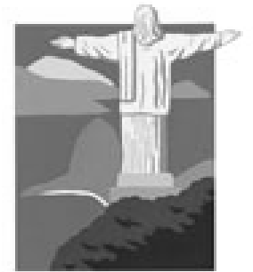
Brazil is famous for its 100-foot-tall "Christ the Redeemer" statue overlooking Rio, though most Brazilians don't truly know Him.