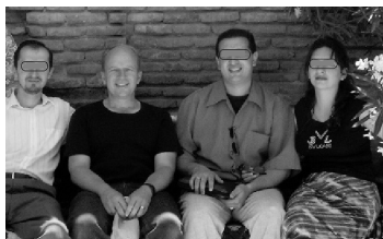
Dad and the Kurds

Shopping was a favorite thing for all of our group. We